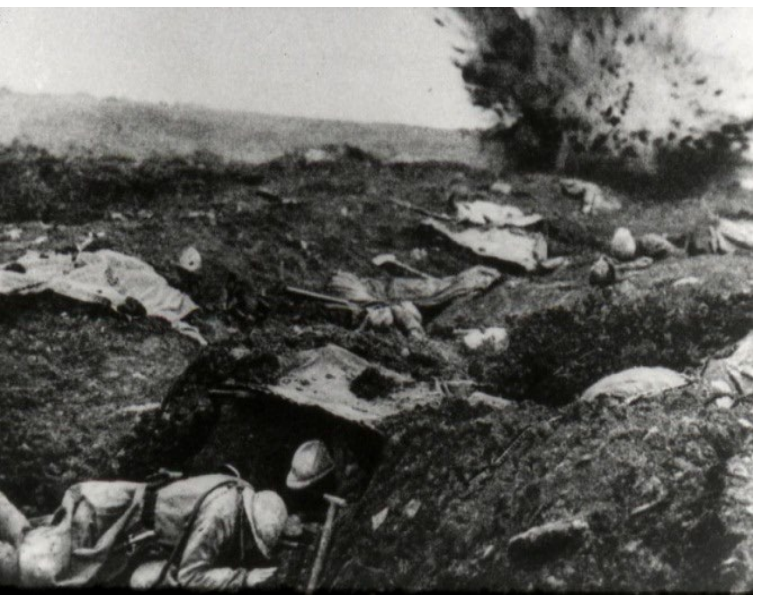
The battle of Verdun (1916)