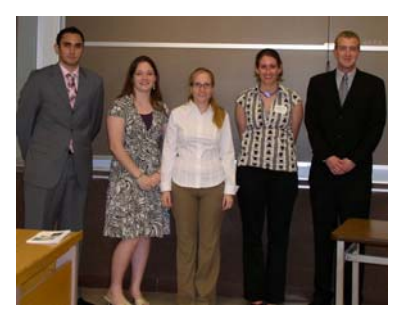
Honors students at

Needham. Congratulations to all recipients and best of luck with all your endeavors during this upcoming academic year.