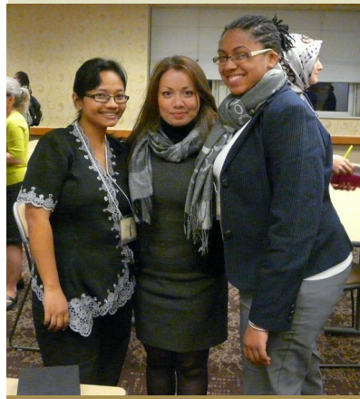
committee responsible for orchestrating this graduate student conference. It gave me the opportunity to interact with a variety of students across the country who are

year's theme, "Interrogating Silence(s): A Critical Examination of Memories, Voices, and Identities in American Studies." The title of the symposium was a response to some of the current trends in