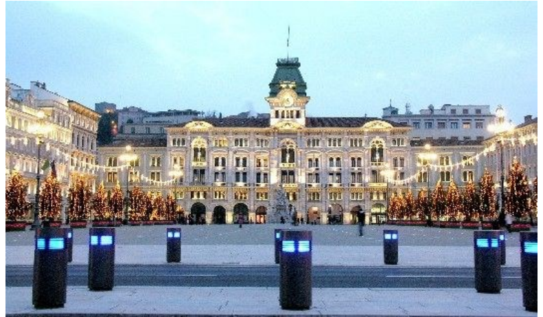
Piazza dell'Unità, positioned directly on the Mediterranean Sea, is one of the most imposing squares in Europe.

According to recent news articles, Italy is the most popular Study Abroad destination in the world. No matter where you go, you will see evidence of over 2000 years of human history expressed by the greatest assemblage of artists, writers, and composers the world has ever seen.